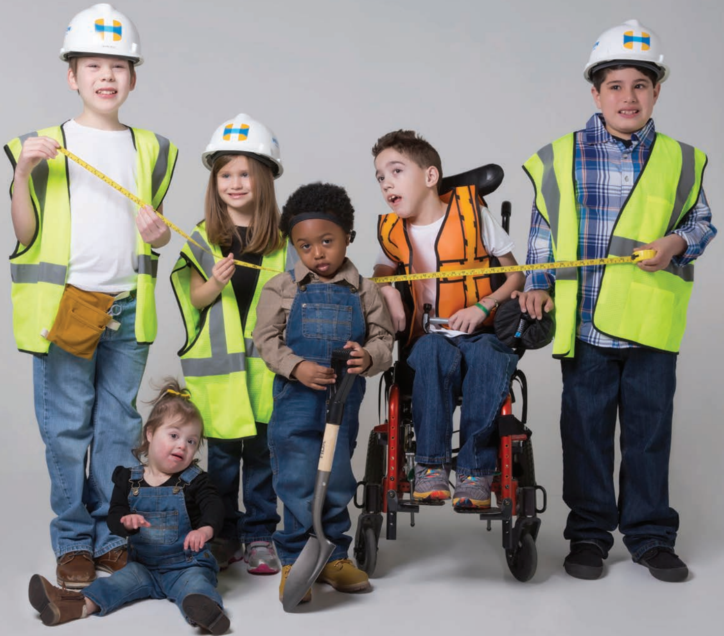
EXPANDING POSSIBILITIES HEARTSPRING CAMPUS EXPANSION PROJECT